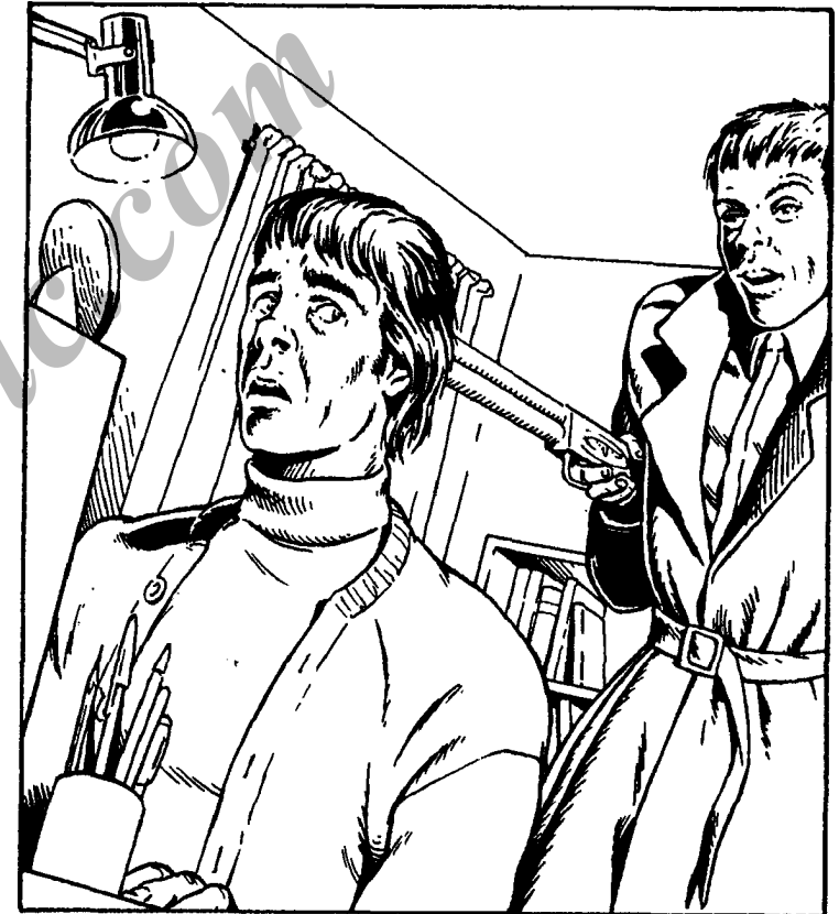
'Just write the note.'