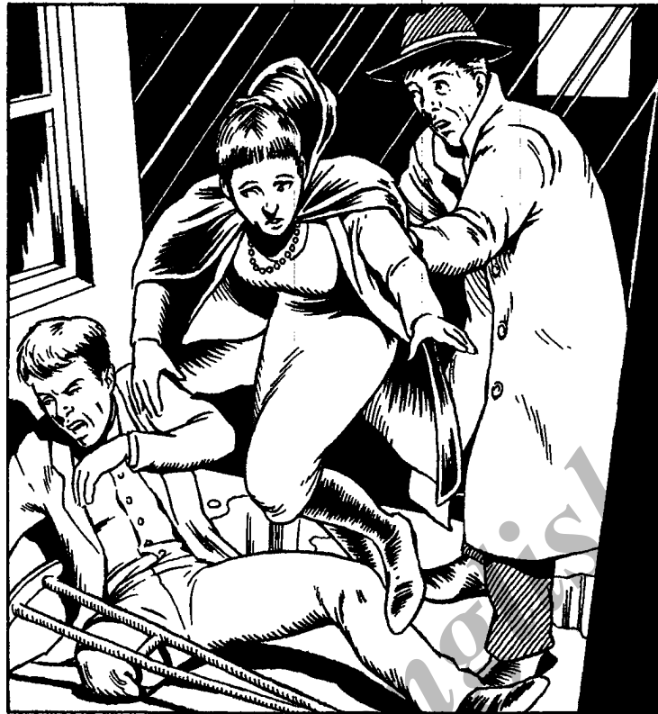
I pushed the princess into the nearest doorway.

The boy smiled as he got up. 'I'm not hurt, but you scared me, jumping on me like that.'