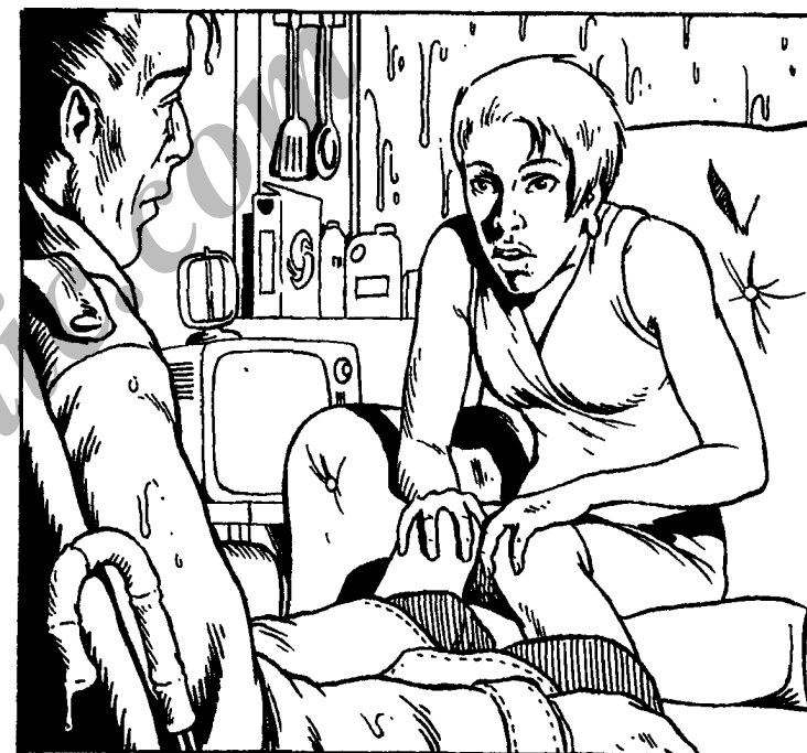
'So will you help me, Mr Nudger?'

'Why should I worry about it any more?' Randy Gantner asked Nudger. He didn't mind talking, because he could have a rest