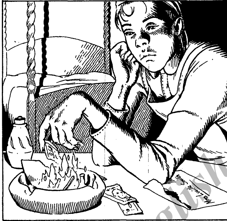
She tore the $20 bill into bits and added these to the fire.

three cigarettes were smoked and she would have liked another, she put them in her top drawer so that they could not tempt her.