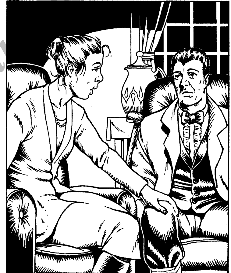
'There is wealth beneath the garage.'

'You said a little while ago that you didn't care who I was,' she began. 'But I want you to know. There are so many of us Russians who were once important people but who are now