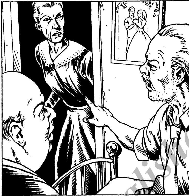
'Did you have your ear at the door long enough to hear everything I said?'

Her face remained calm. 'I'm not in it. I came to tell you that your dinner is ready.'