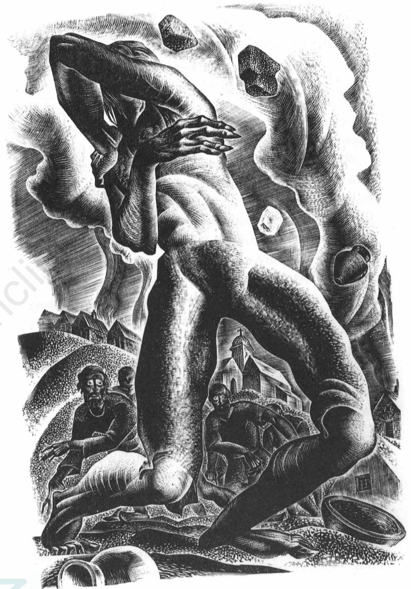
The people shouted and threw stones at me.

Day after day I watched the three people. I saw how kind they were to each other. I wanted so much to go into the house and be with them, but I knew I must stay in the hut. I could not forget how the village people had hurt me when I tried to go into the house there.