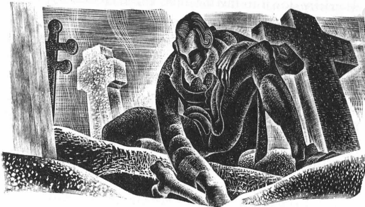
I bought or stole all the pieces of human body that I needed.

Its legs and arms were the right shape, but they were huge. I had to use big pieces because it was too difficult to