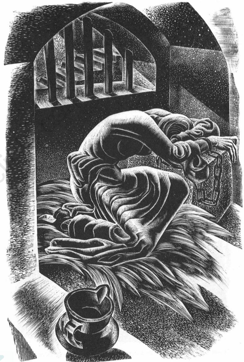
In the prison Justine waited quietly for death.

Slowly I became calmer among the beautiful mountains. I learnt to sleep again, and for days I did not see anybody.