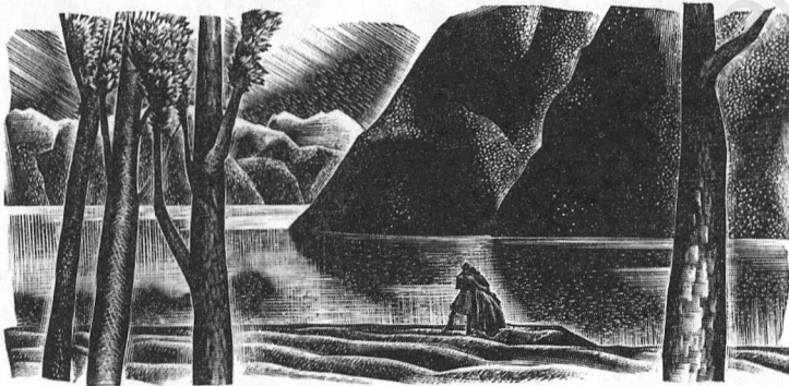
The mountains and the lake were calm and beautiful, and at last Elizabeth and I were together.

After the wedding a large number of our friends came to a party at our house. When the party had started, Elizabeth and I said goodbye and left for our honeymoon. We travelled first by boat, and planned to spend the night at a hotel on the other side of the lake. The mountains and the lake were calm and beautiful, and