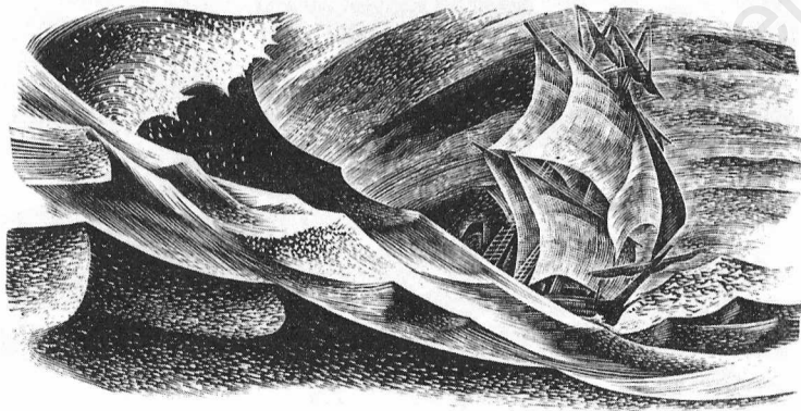
Soon night came, and in the night there was a storm.

The sailor was pointing to a piece of ice that was floating near the ship. A man was sitting on the ice, and