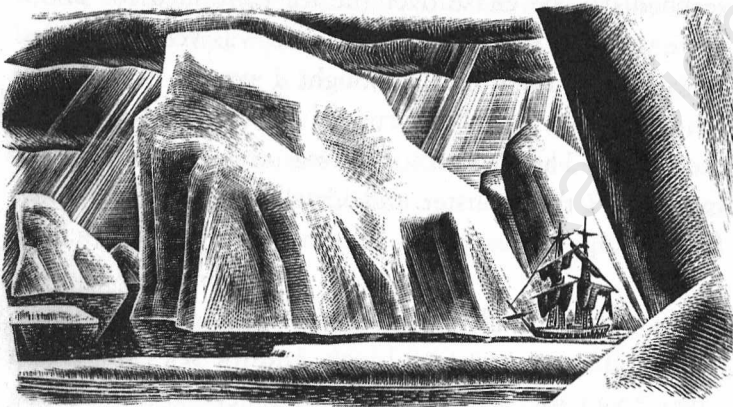
Many hours went by, and then I saw your ship.

Goodbye. This is the end of Victor Frankenstein's story.