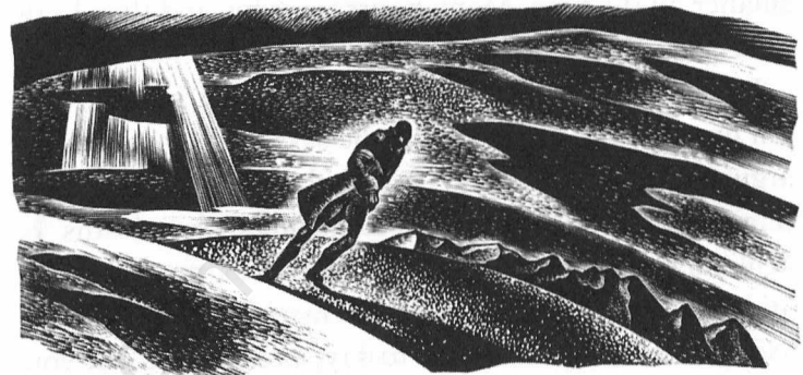
I followed the monster to the cold lands of the north.

In his last message the monster told me that he was going north. He wanted to take me where the cold would hurt me and make me more miserable. I followed him to the cold lands of the north, and bought dogs and a sledge.