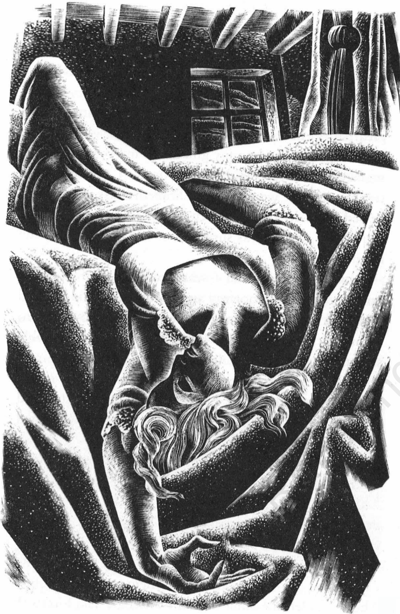
On the bed, Elizabeth lay still, in the cold sleep of death.

After many months they let me free. I had only one wish – to find and kill the monster.